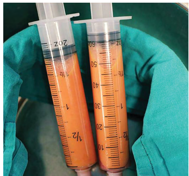
Fig. 3. Fat in a doughnut. The feeding syringes are kept upside down for fat to decant and are supported by a sterile wrap.

After fat decantation, the infranatant fluid is suctioned and the fat is prepared for injection. We prefer adding 2 ampoules of gentamicin to each liter of decanted pure fat.