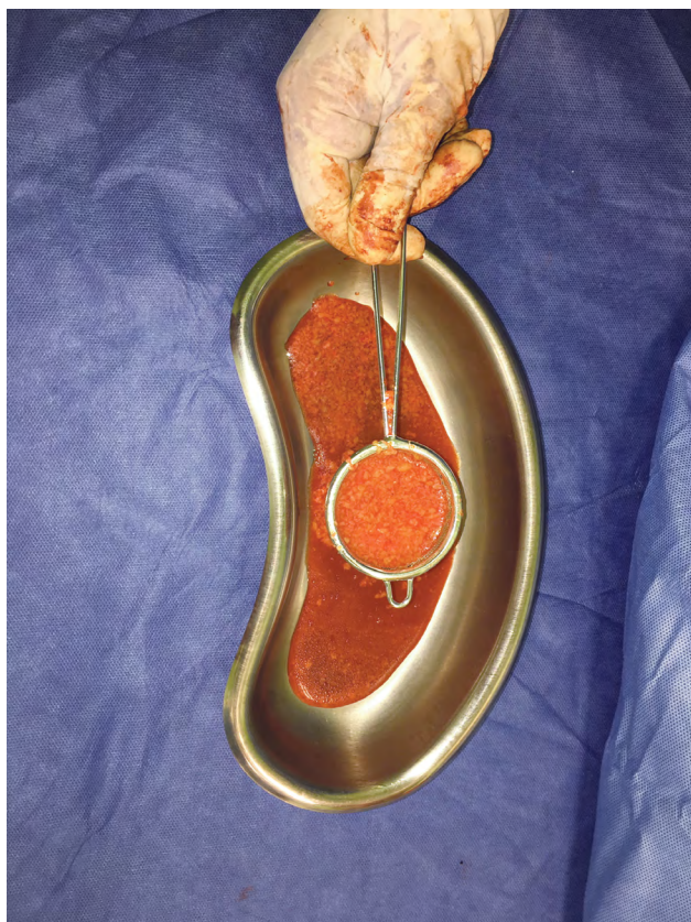
Fig. 4. Stainless steel nets are used for fat filtration. The net is cheap and can be autoclaved.

Using the feeding syringes and a sterile silicone lumen, the cannulas used for harvesting are used for injections.