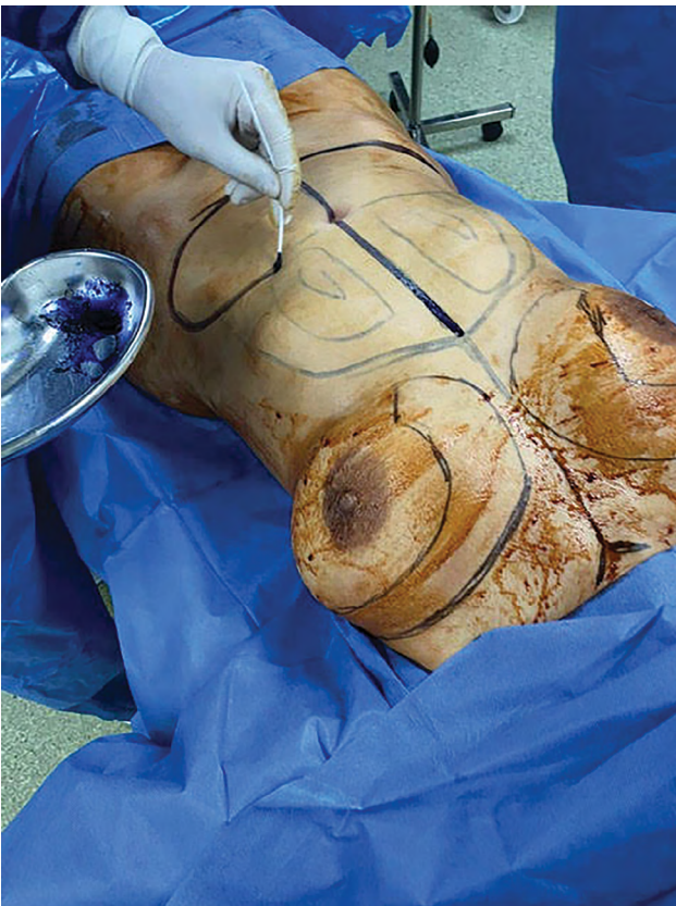
Fig. 2. A swab collection stick (instead of a marking pen) dipped in methylene blue stain is used to reinforce the markings intraoperatively.

The fat harvested for reinjection needs to be collected in sterile containers. The under-water seal (chest tube) represents an excellent alternative for fat collection, which is much cheaper than regular containers. The chest tube creates an isolated air-sealed suction, and the fat is